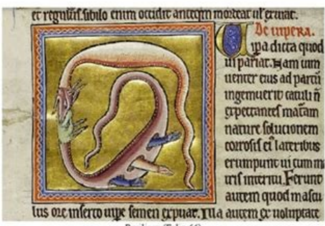
Basilisco (Folio 66)

El basilisco puede ser conquistado por comadreja. Los hombres las introducen a las cuevas donde los basiliscos se esconden. Al verlas, los basiliscos huyen, las comadreas los persiguen y los matan.